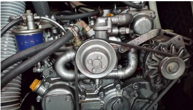
Yanmar 4JH3E - 55hp 4 cylinder