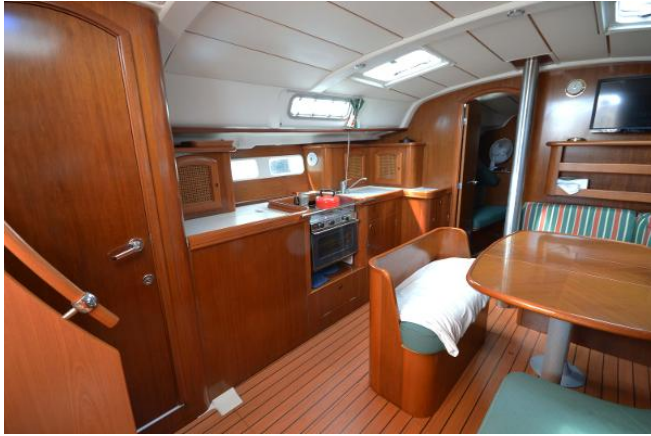
Salon & Galley