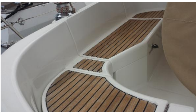
Cockpit seating 2