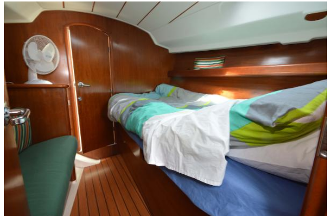
Main double starboard