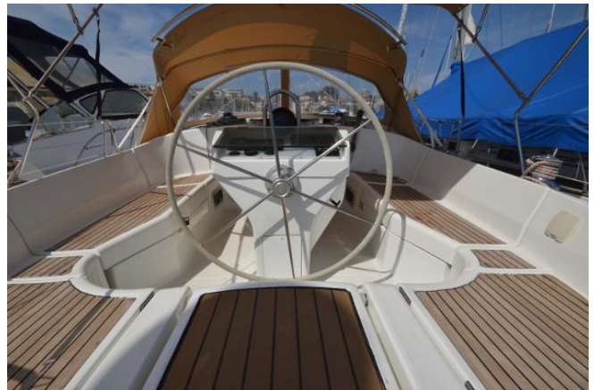
Cockpit Seating 1