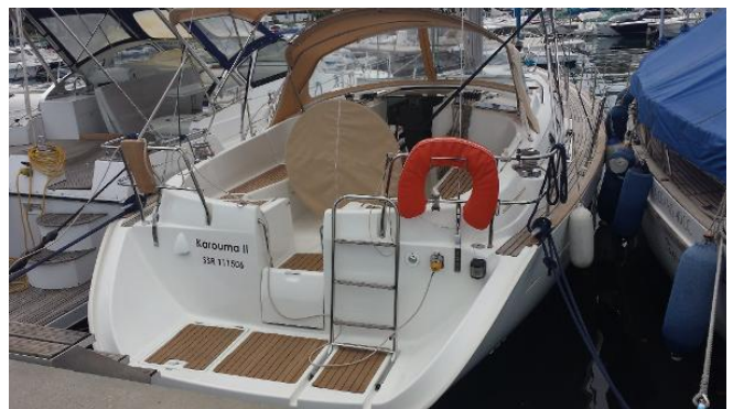
Beneteau Oceanis 411