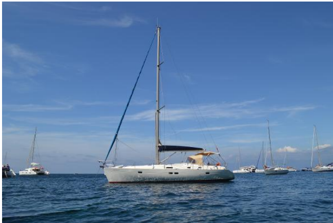
Karouma 11 at anchor