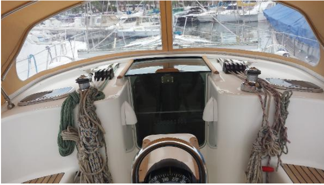
Companionway and new Sunbrella spray hood