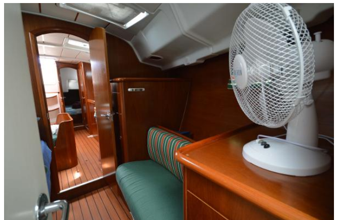
Owners cabin port side