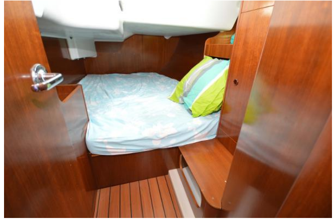
One of two near identical guest cabins